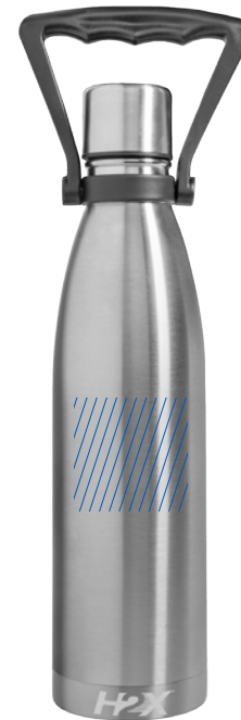
CUSTOM IMPRINT AREA 2"W X 2"H