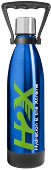
CAPPED BLUE 447627