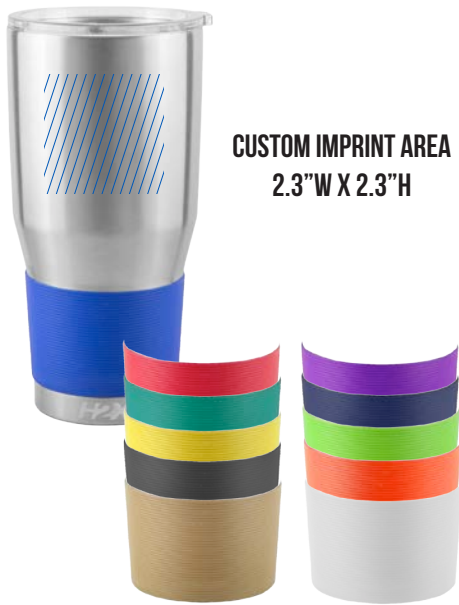
CUSTOM IMPRINT AREA 2.3"W X 2.3"H