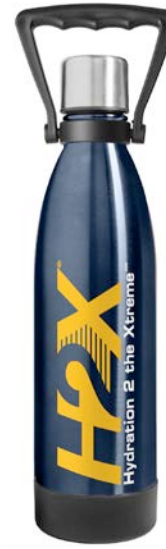
CAPPED NAVY 447628