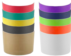
SLEEVE COLOR OPTIONS