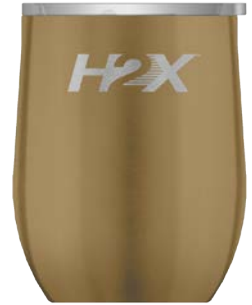
BRUSHED GOLD 477387