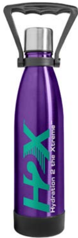
CAPPED PURPLE 447551