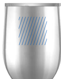
CUSTOM IMPRINT AREA 1.5"W X 1.5"H