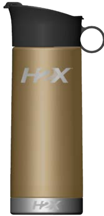
BRUSHED GOLD 477395