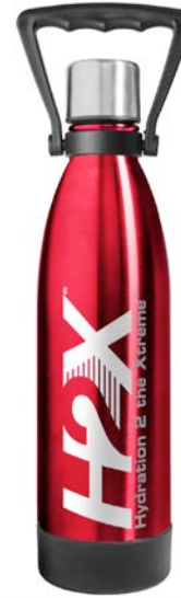
CAPPED RED 447629