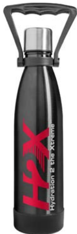
CAPPED BLACK 447550