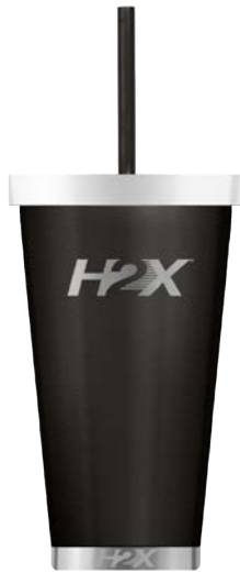
MATTE BLACK 477410