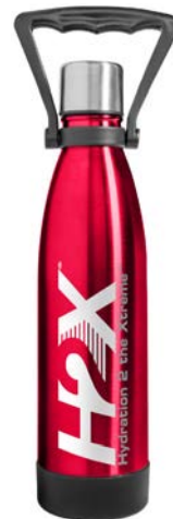
CAPPED RED 447555