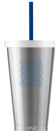
CUSTOM IMPRINT AREA 1.75"W X 2"H