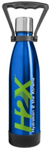
CAPPED BLUE 447553