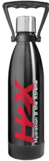
CAPPED BLACK 447624