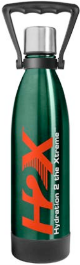
CAPPED GREEN 447626