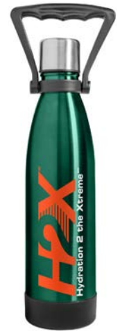
CAPPED GREEN 447552