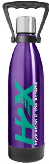
CAPPED PURPLE 447625