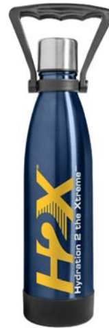
CAPPED NAVY 447554