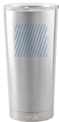
CUSTOM IMPRINT AREA 2"W X 2"H